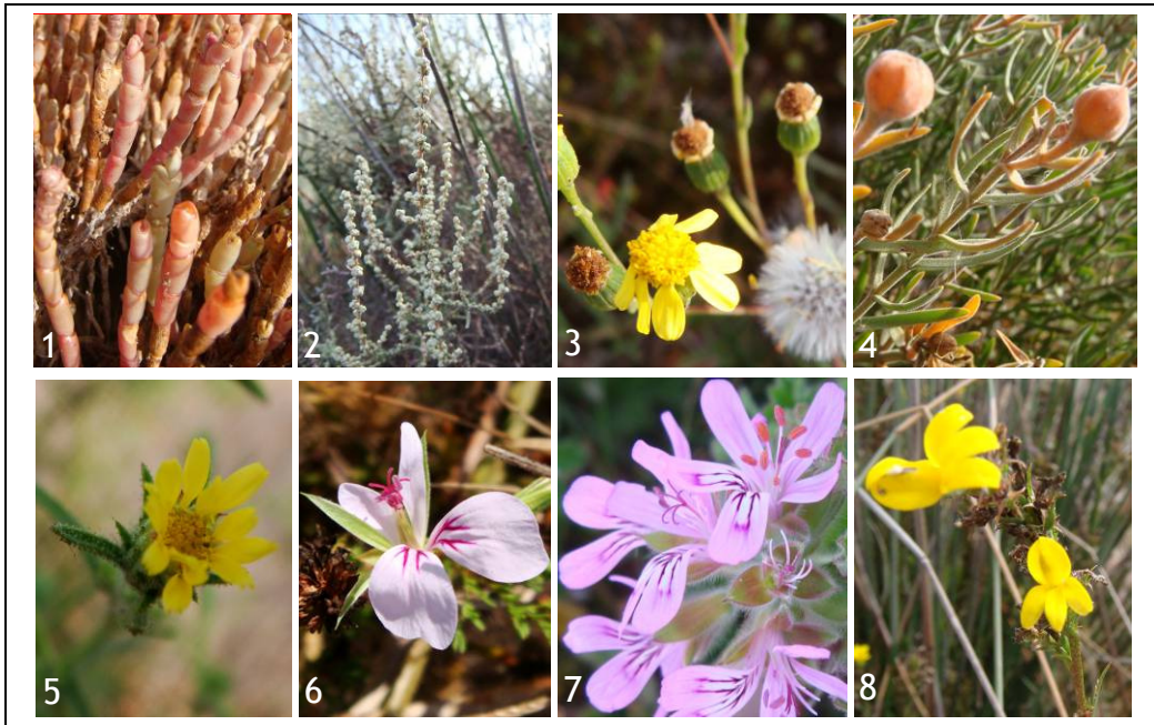
1) Sarcocornia perennis , 2) CF Plecostachys serphillifolia , 3) Senecio CF burchellii , 4) Orphium frutescens 5) Unidentified sp , 6) Pelargonium sp , 7) Pelargonium sp , 8) Monopsis lutea